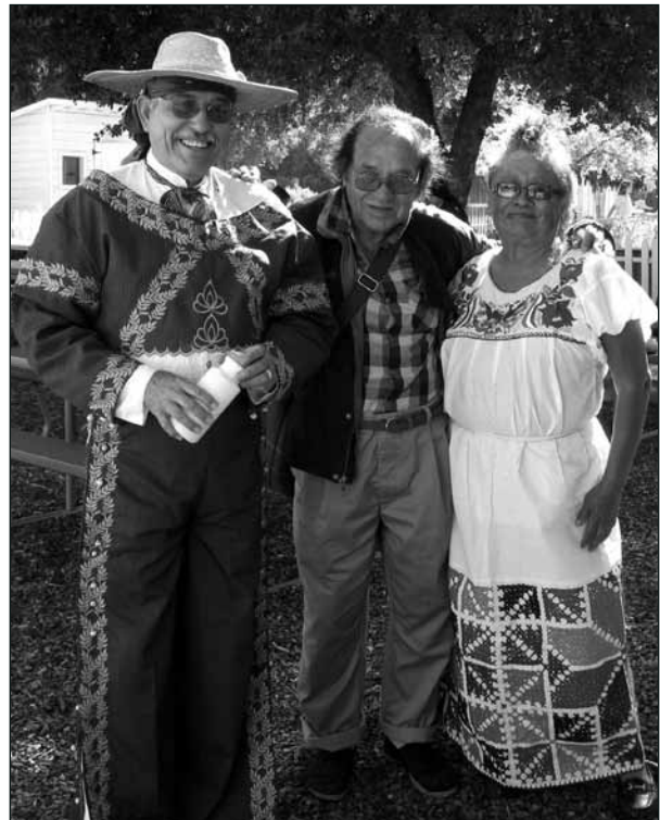
Exhibitors at the Fandango

In addition, one of the Anza Trail partners, Peralta Hacienda Historical Park, offered the children lessons in corn husk doll making. Over thirty adults and children took part. Several other activities were also being offered around the event, as children were dancing, there were others making clay pots, while others were making Muwekma Ohlone clapper sticks. The evening included a blessing in the Ohlone dialect, with Spanish and English translations.