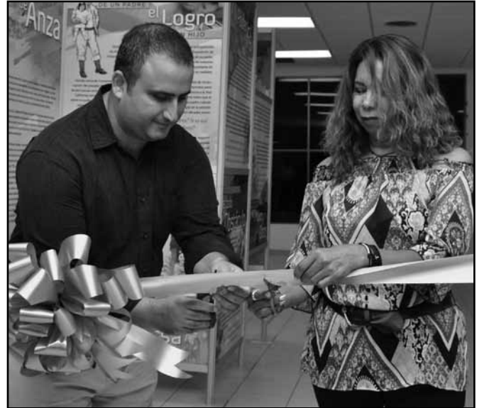
Ribbon Cutting at the Nogales, Sonora, MX exhibit

The exhibit made its Mexican debut at the Cultural Center IMFOCULTA, in Nogales, Sonora, where it will be on display through December 2011. An opening reception was held on August 18th and was attended by officials from both sides of the border.