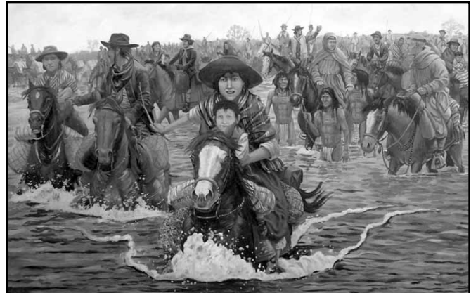
Artist Rendition of Crossing the Colorado River