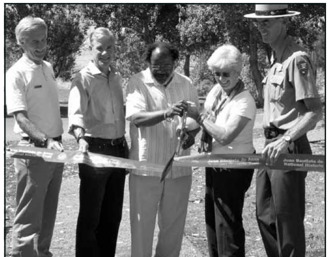
Ribbon cutting for new exhibits

To see the brochure visit: www.nps.gov/juba/upload/Anza-Brochure-3-21small.pdf