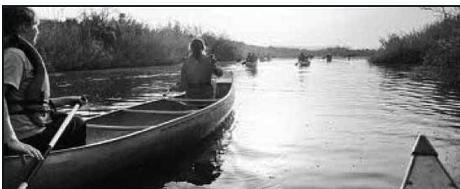
River Trail Users

The Anza community can help support this effort by staying aware of the progress, commenting on draft plans in the review process, and eventually helping to build the trail or interpretation facilities.